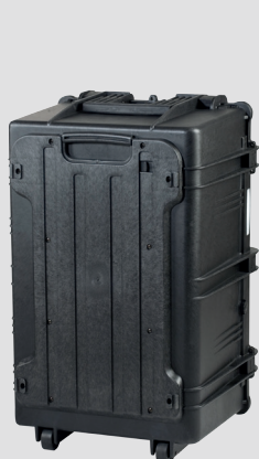
Back Retractable handle